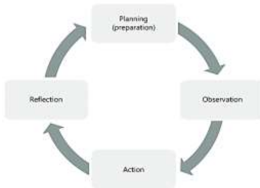
Figure 1. Action Research Cycle