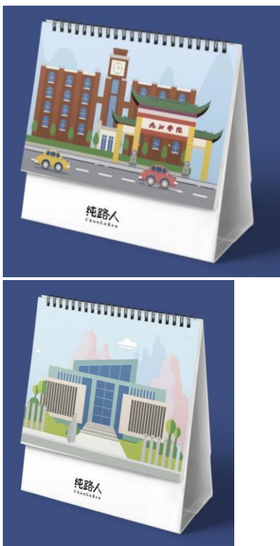
Figure 1: Design of cultural and creative product package

It is not expressed in the form of a single way of thinking and cultural orientation on campus, but in the form of a unique thought and cultural orientation. One of the key points in the development of cultural and creative products on campus is the act of "integrating the campus system with the existing materials on campus to spread campus culture". The development of campus cultural and creative products also requires the use of campus cultural resources, emphasizing cultural and aesthetic values, and highlighting the importance of logos. In the design process of cultural and creative products, "bright and bright" and "conceptual expression" are extremely important, and cultural labels must play a "bright" role. The logo conveys the empathy of "eye-catching", which is also the embodiment of the cultural value and aesthetic value of the product. The campus cultural image is like the DNA of the campus, which can activate people's memory, establish the value of emotional interaction and memory connection, and effectively display the characteristics and nature of the campus.