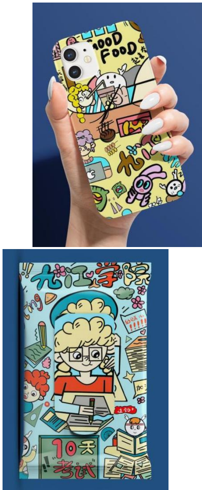
Figure 2 the design of cultural and creative product series with students as the theme.