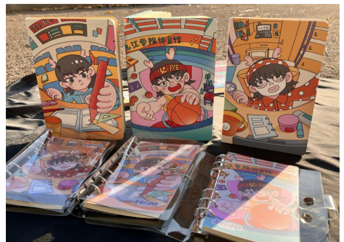
Figure 3 University stationery product design

wonderland. The interaction and connection between different designs constitute a complete cultural and creative product system, which realizes a full range of product functional requirements. In the process of designing cultural and creative products in colleges and universities, three main ways should be prioritized: one is to expand the product portfolio based on visual images, the other is to expand the product portfolio based on function or usability, and the third is to divide different cultural themes based on different product mix. These all help to catch the audience's attention and stimulate people's desire to actively understand the content of the product.