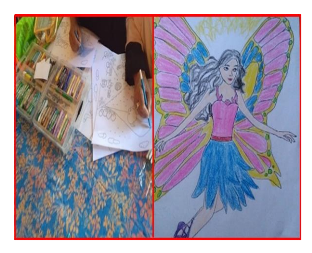
Figure 2. Art Therapy was given to the "scraping + art therapy" treatment group