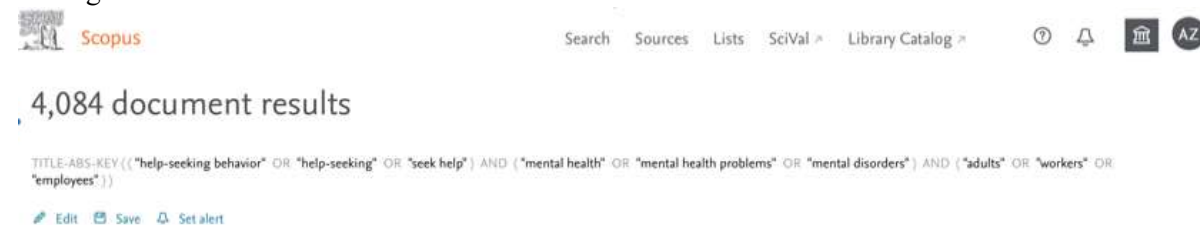
Figure 2. The number of documents retrieved on the Scopus database using the search string

problems' in the context of adults. The keyword search process managed to retrieve 4084 documents in total.