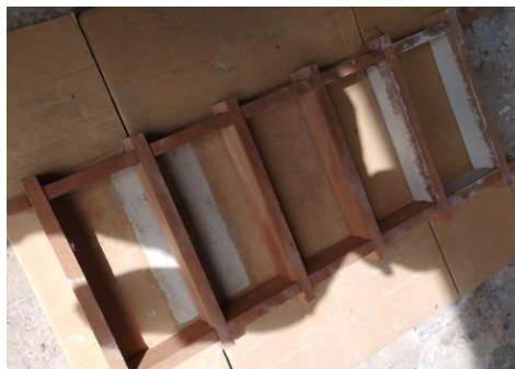
Figure 6. Wooden brick molds in Ceiba type.

properties of high resistance to water, they will not present deformations that affect the accuracy of the brick dimensions, and, therefore, the useful life time of the molds is not reduced, as shown in figure 6.