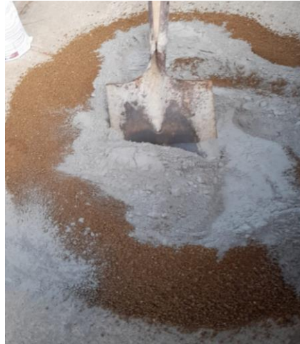
Figure 4. BTC commodity mix