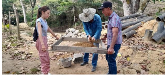
Figure 2. Screening of clay and coffee husk.

sieve the raw materials before mixing them, as shown in figure 2.