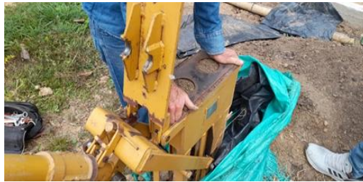
Figure 1. CIMVA-RAM Manual Press for BTC.

The test described in the UNE 41410 standard "Resistance to wetting/drying cycles", in which it is determined whether a block is suitable or not to be implemented in construction, when it is submerged 6 times for 30 seconds at a depth of 10 mm, and after the last submersion, being completely dry, it does not show cracks, changes in volume, loss of material or absorption of large amounts of water. It is there where, not presenting any of these pathologies, the blocks can be used in the construction of houses (Tutor Vicente, 2015).