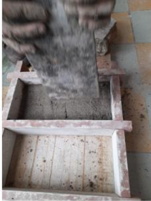
Figure 10. Compaction of the mixture in the wooden molds.

and achieve maximum compaction, as shown in Figure 10.