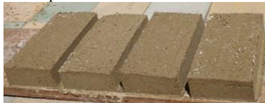
Figure 12. Drying of the bricks at room temperature

the future. It is recommended to let them dry at room temperature for at least 5 days, protecting them from humidity, rain and water sources close to their place of deposit.