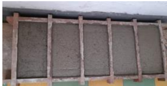
Figure 11. BTC bricks contained in wooden molds.

The shape and compaction of the bricks should be as shown in Figure 11.