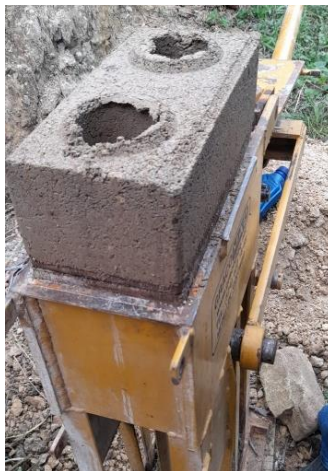
Figure 9. BTC obtained after demolding the specimen from the manual press.

In the case of not having a CIMVA-RAM press, the compaction is done manually, in which the mixture is poured in three layers, in the wooden