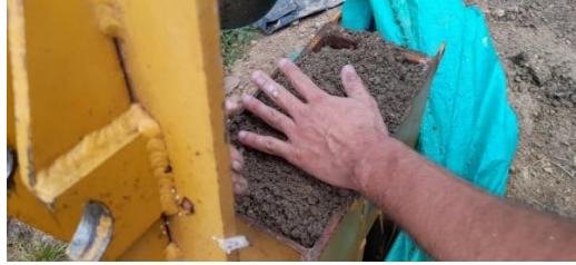
Figure 7. Deposition of the material in the CIMVA-RAM manual press.

one, the materials are compressed with the platens of the machine, as shown in figure 8, and immediately, when demolding it, the block of compressed earth is obtained, as it is evidenced in figure 9.