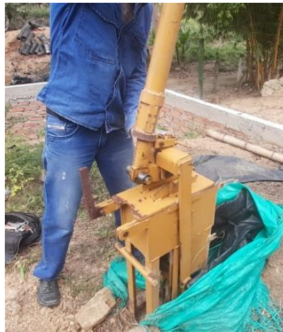
Figure 8. Compression of the bricks with the hand press lever.