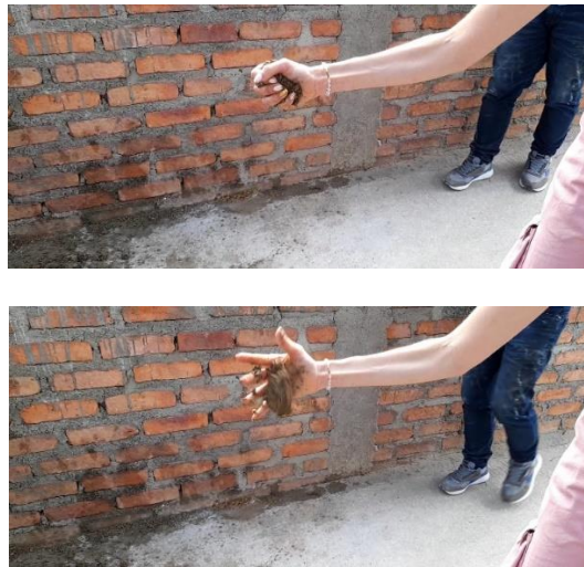
Figure 3. Determination of optimum moisture content of the mixture.

hands, as shown in figure 3, then, this handful of soil will be dropped to a height of approximately 1 meter. If the soil disintegrates into several pieces when it hits the soil, it means that the mixture lacks water; if, on the contrary, the fingers are marked on the ball of soil, and when it hits the soil it does not fragment, it means that there is excess water.