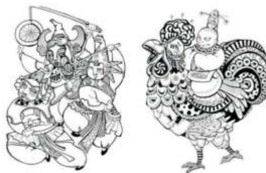
Figure 4: Image innovation

the uprightness and impartiality spirit of heroes. Combined with the above characteristics, exaggerated expression techniques can be used in the process of pattern re-creation, whether it is the facial expressions of figures or the dynamics of figures can be exaggerated, and then re-created with reference to modern formal language.