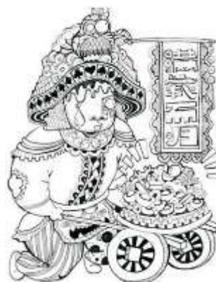
Figure 3: The use of lines

The engraving lines of the traditional New Year Pictures of Tantou are divided into negative and positive carvings. Since woodblock carvings are used, the lines presented in the pictures are bold and unrestrained, strong and powerful, with strong contrast, hardness and softness, and full of charm. The traditional New Year Pictures of Tantou are made of peach wood. Peach wood has very strong toughness and can be easily carved with thick and thin lines. It adopts the iron line drawing technique of ancient figure painting, especially on the clothing pattern, which is very prominent, the lines are thick and strong, with a typical, unique, simple, thick and strong style of northern nationality. It pays attention to thickness, strength, density, smoothness, twists and turns, setbacks, starting and closing the knife, etc.