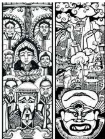
Figure 2: Innovative design of wood New Year paintings

As shown in Figure 1, the whole picture is very compact. Although there are many characters, it does not appear chaotic. The skeleton lines are clearly visible. Because the skeletons are evenly divided, the picture is clear in primary and secondary, and the relationship between the subject and the object is clear. The traditional New Year Pictures of Tantou are centered on the middle figure and the surrounding figures are auxiliary. Although the picture is full, it is not cumbersome, the composition is very symmetrical, and the decoration is very strong. The overall picture has a certain sense of rhythm, while taking into account the beauty.