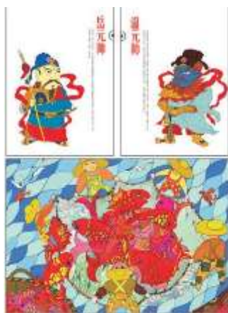
Figure 5: Color innovation

The traditional New Year Pictures of Tantou boldly use simple and bright colors, such as red, yellow, green and purple, and they are also very bold in the amount of pigment, which is almost equal to the proportion of colors. For example, the image of Zhong Kui uses a lot of purple as the color of the face part, the whites of the eyes are yellow, the green robes are alternated with yellow and purple, the eyebrows and beard are also yellow and purple, looks angry and fierce, making the exorcism general more deterrent and shocking force. When expressing other themes, it is also inseparable from the use of these colors, there is just the emphasis changes of the colors proportion.